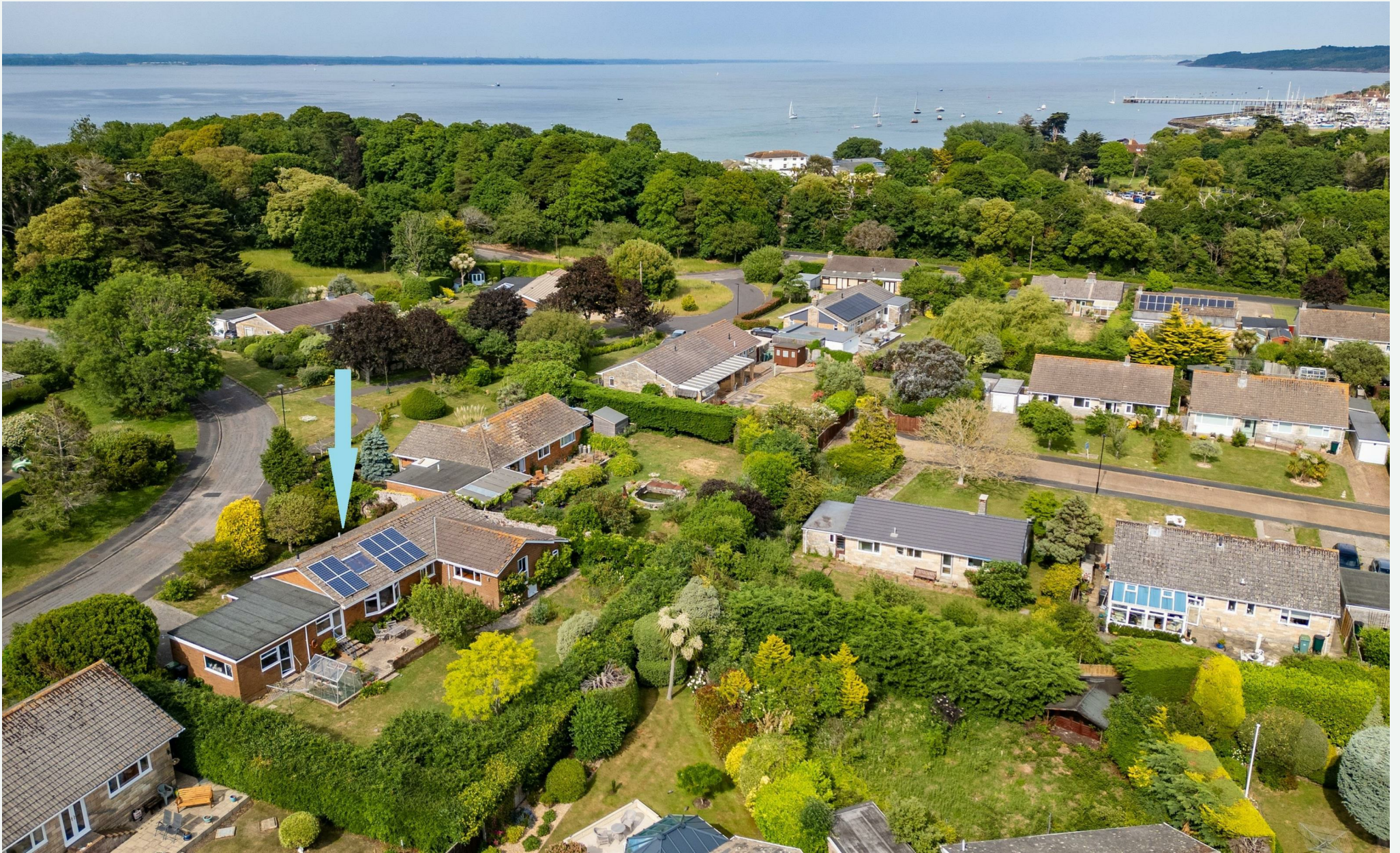
Vikings, Norton, Yarmouth, Isle of Wight